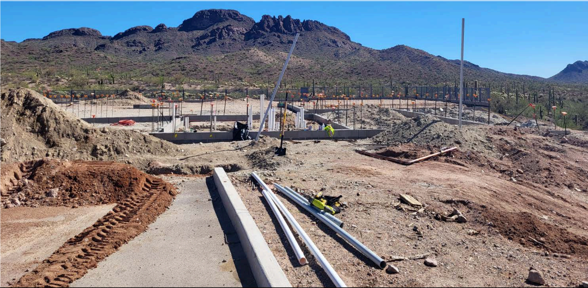
NATURE CENTER PLUMBING ROUGH IN