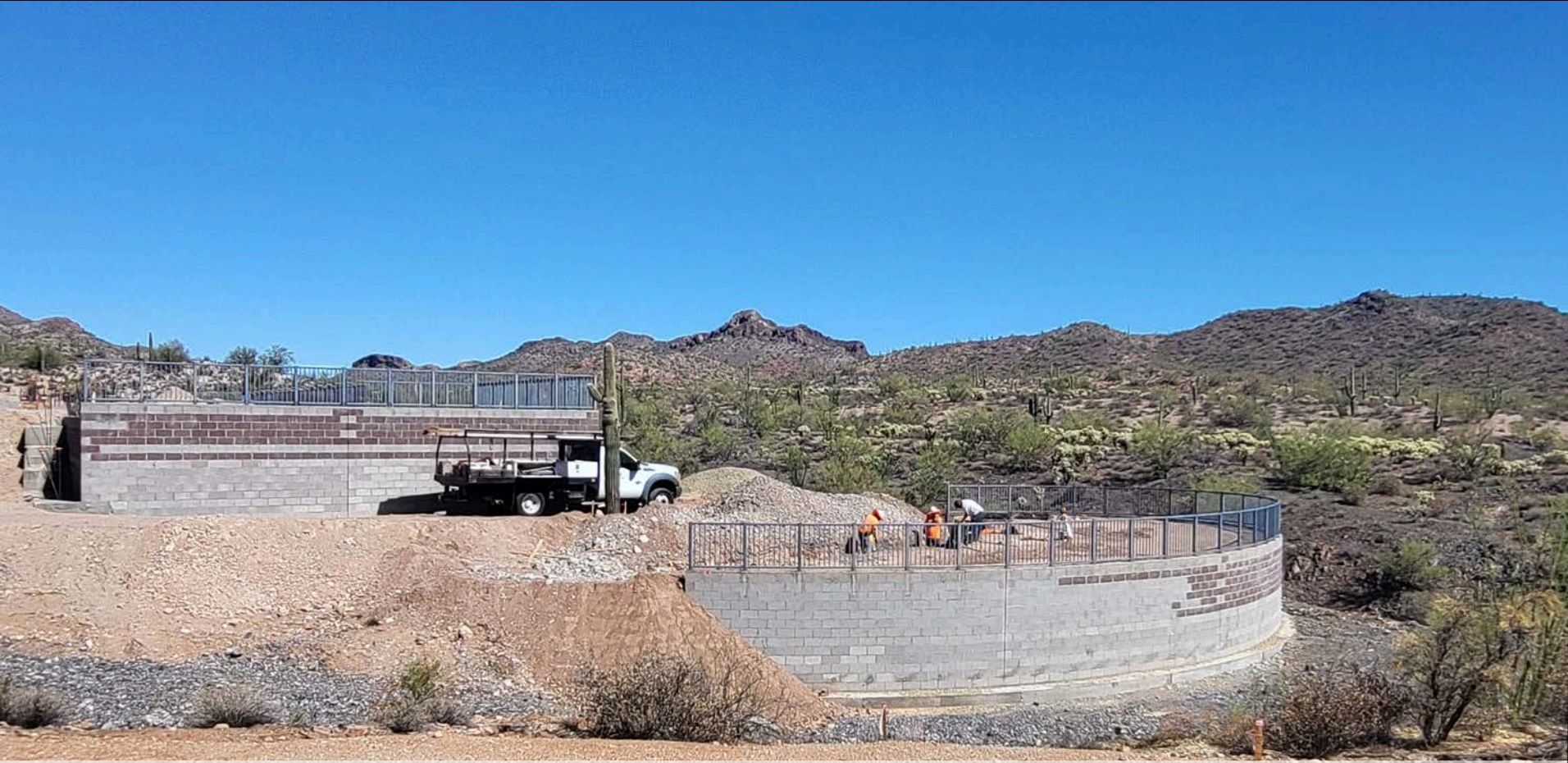
NATURE CENTER VIEWING AREAS