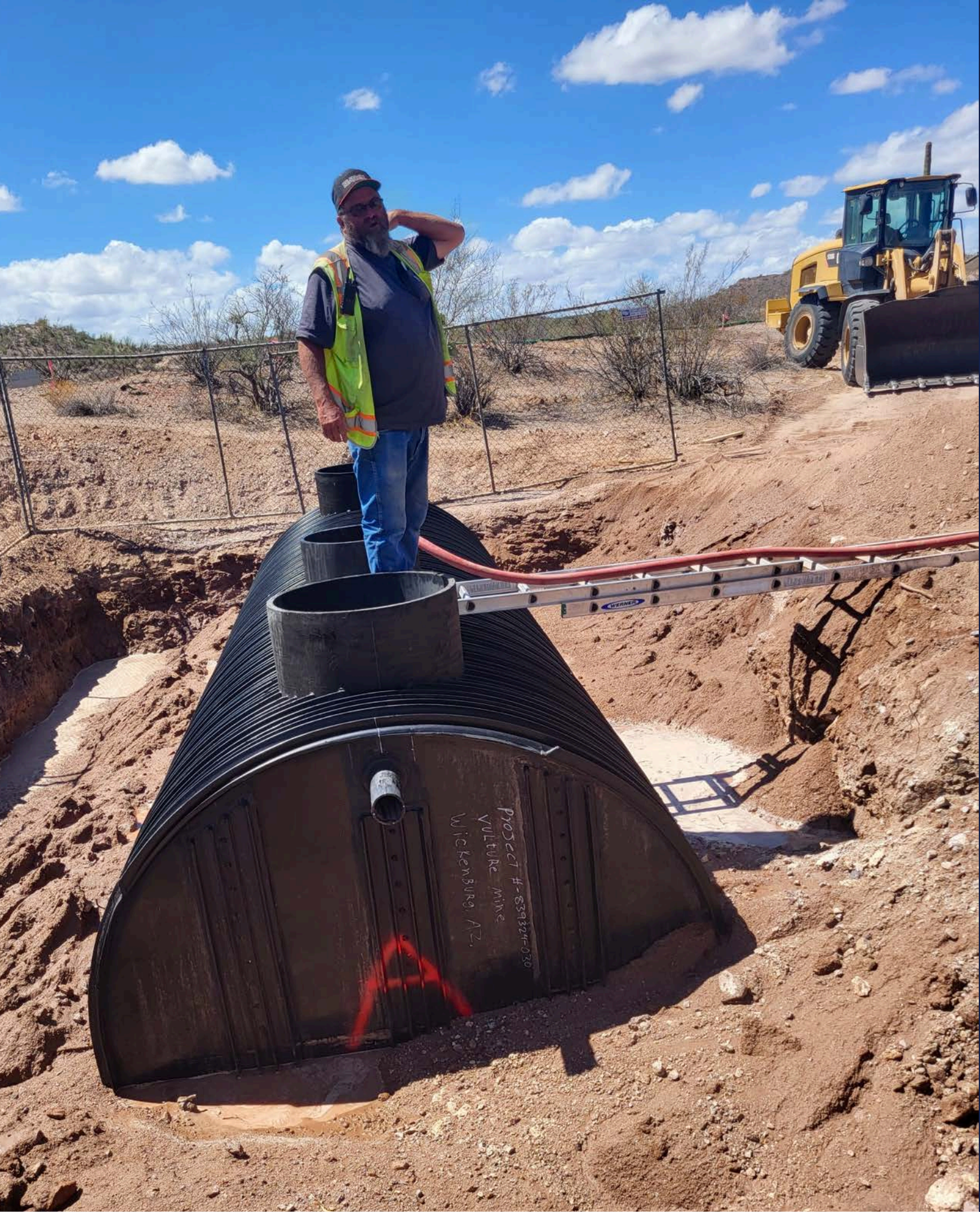
INSPECTING THE SEPTIC TANK