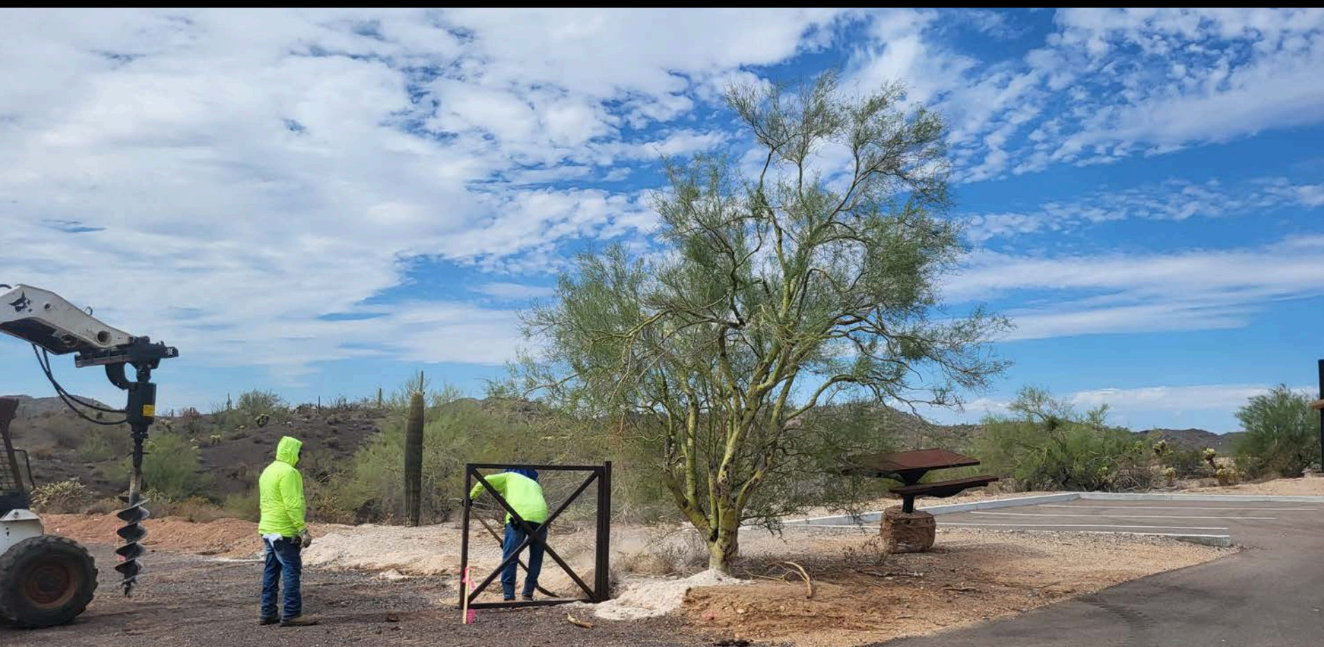
INSTALLING DECORATIVE FENCE AT DAY-USE AREA