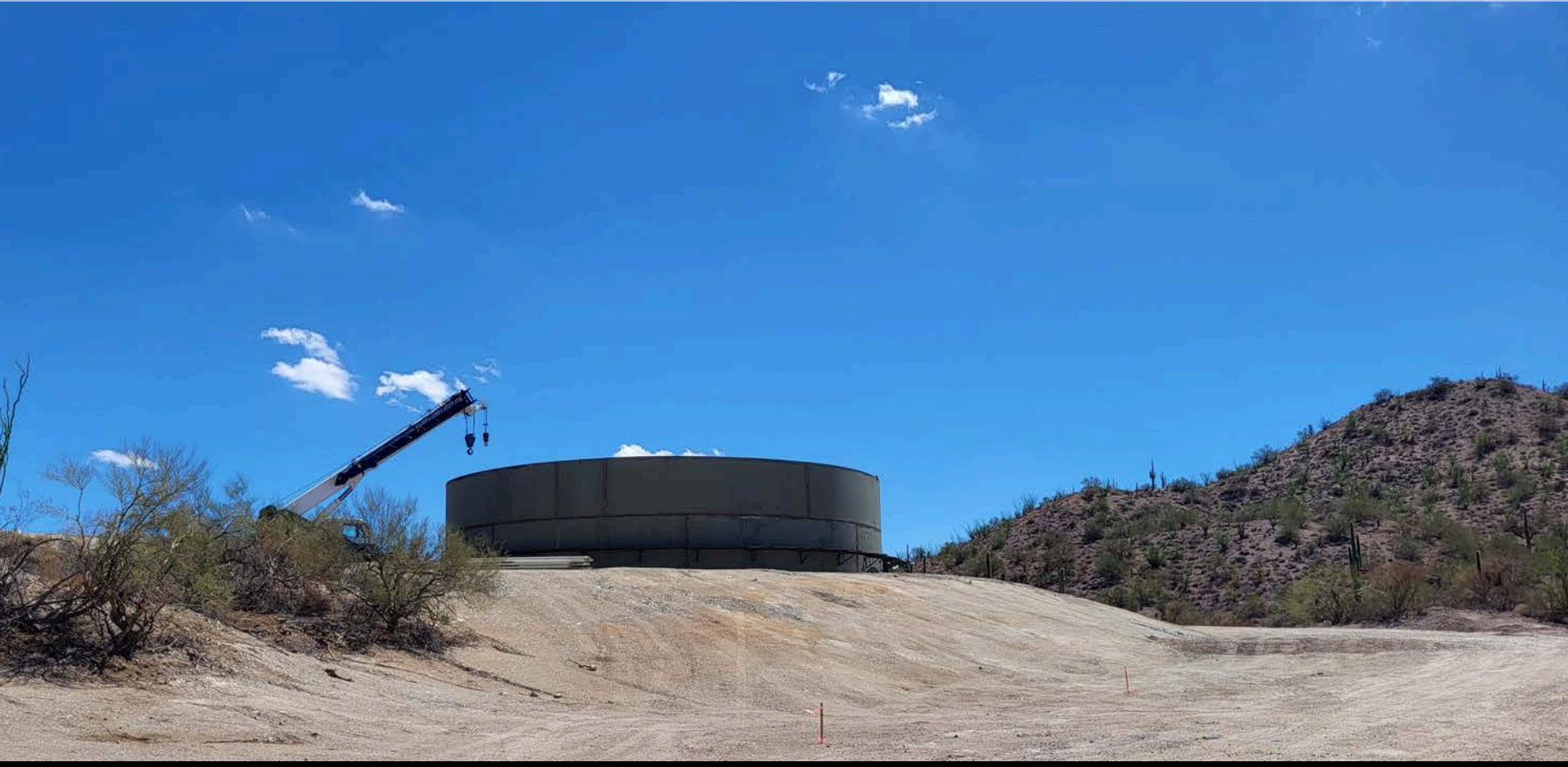
WELL SITE CONSTRUCTION