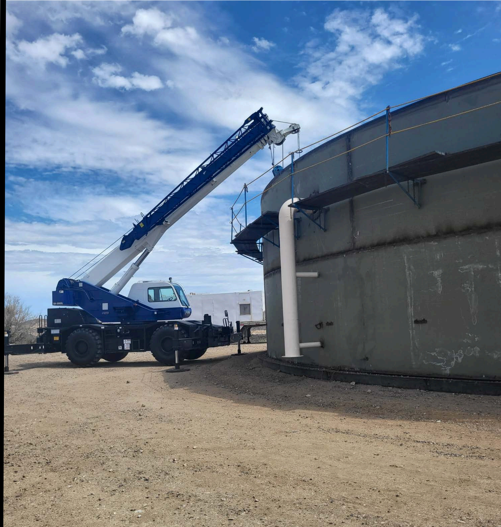
WELL SITE CONSTRUCTION