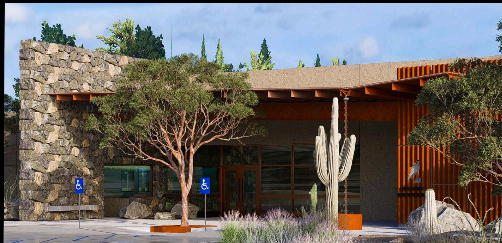
NATURE CENTER RENDERING